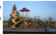
Many community members helped make our new park equipment possible through their financial generosity

Residents of Elwood take pride in their community and play an active role in its care. The local newspaper keeps residents informed of local news, sports, funerals, and coming events.