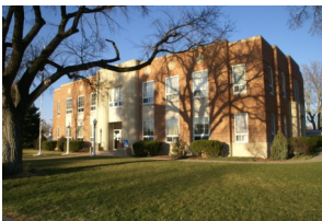
Gosper County Courthouse

The businesses of Elwood are essential for comfort and good living. In the center of downtown you will find the local grocery store. Not too far away from there you can find a convenience store and gas station which also has a small motel. There is a bar and restaurant, implement dealer, and a well drilling business. Elwood has an attorney, real estate brokers, insurance companies, newspaper, two banks, and auto repair businesses. There is also large grain handling, small manufacturing, irrigation and salvage, a locker plant, and construction companies. A funeral home recently opened and a number of small antique stores are in the area and you will even find a doctor's office located in town.